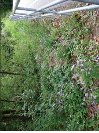
Mona Terrace After: Blue Mistflower, Columbine, Silky Dogwood, ...