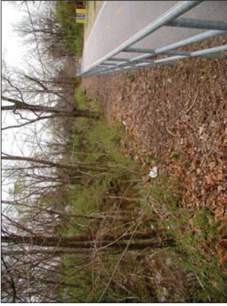
Mona Terrace Before: Bush Honeysuckle

Note: See planting plan for species list. Upon installation, minor rearrangements were made based on micro-climate.